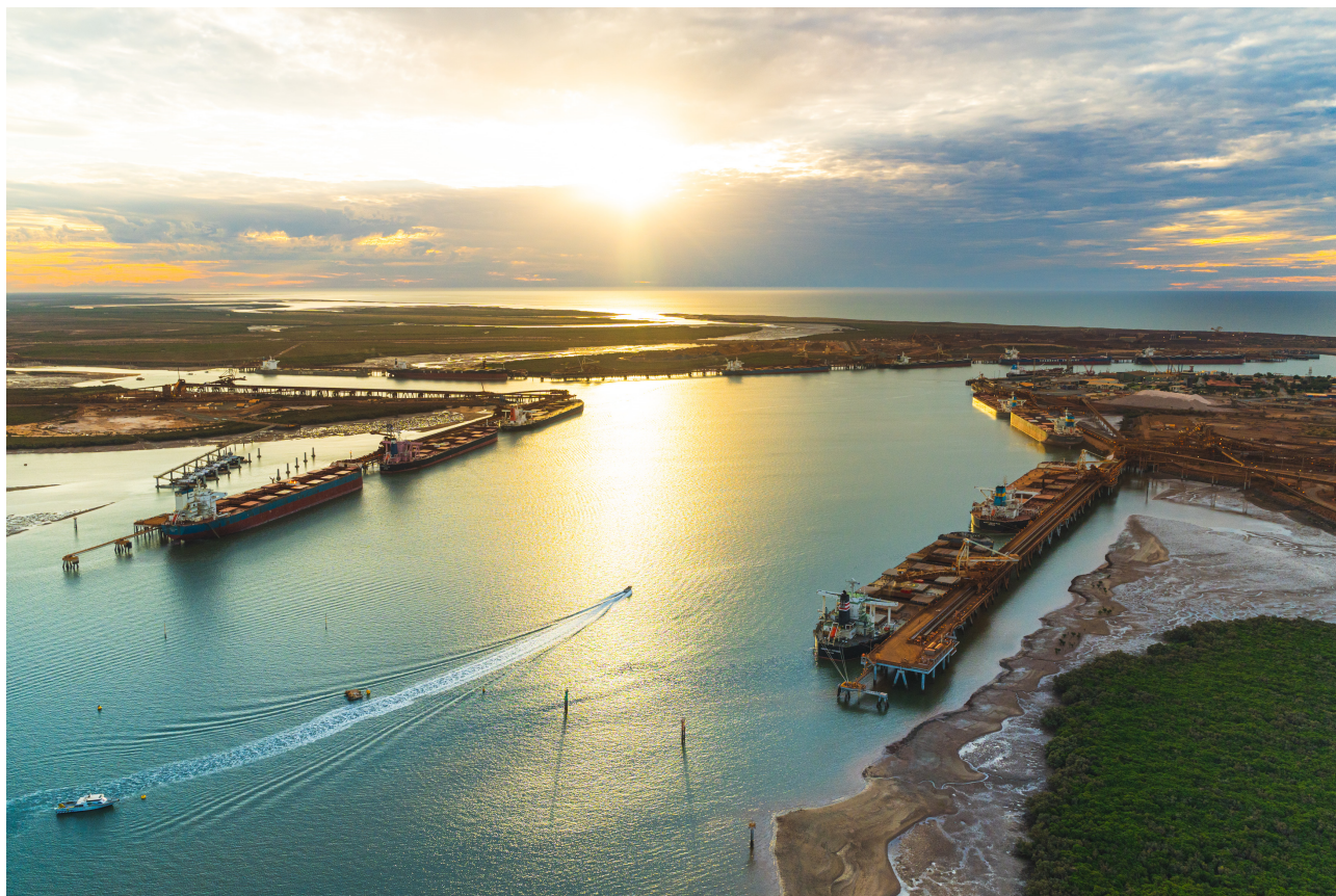
Figure 5: Port Hedland Port

For further information please visit the Company's website at www.alienmetals.uk or contact: