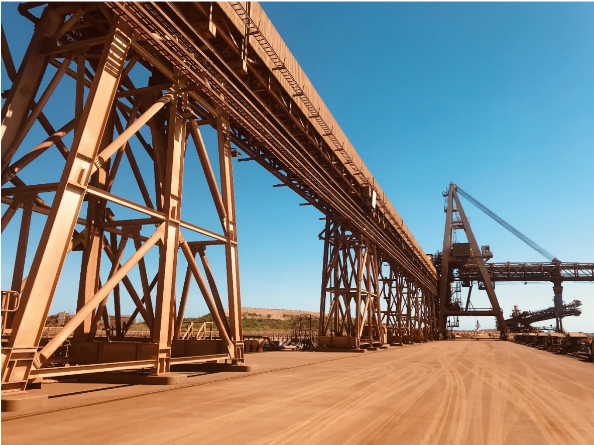
Figure 4: Utah Point, Multi User Berth at the Port of Port Hedland