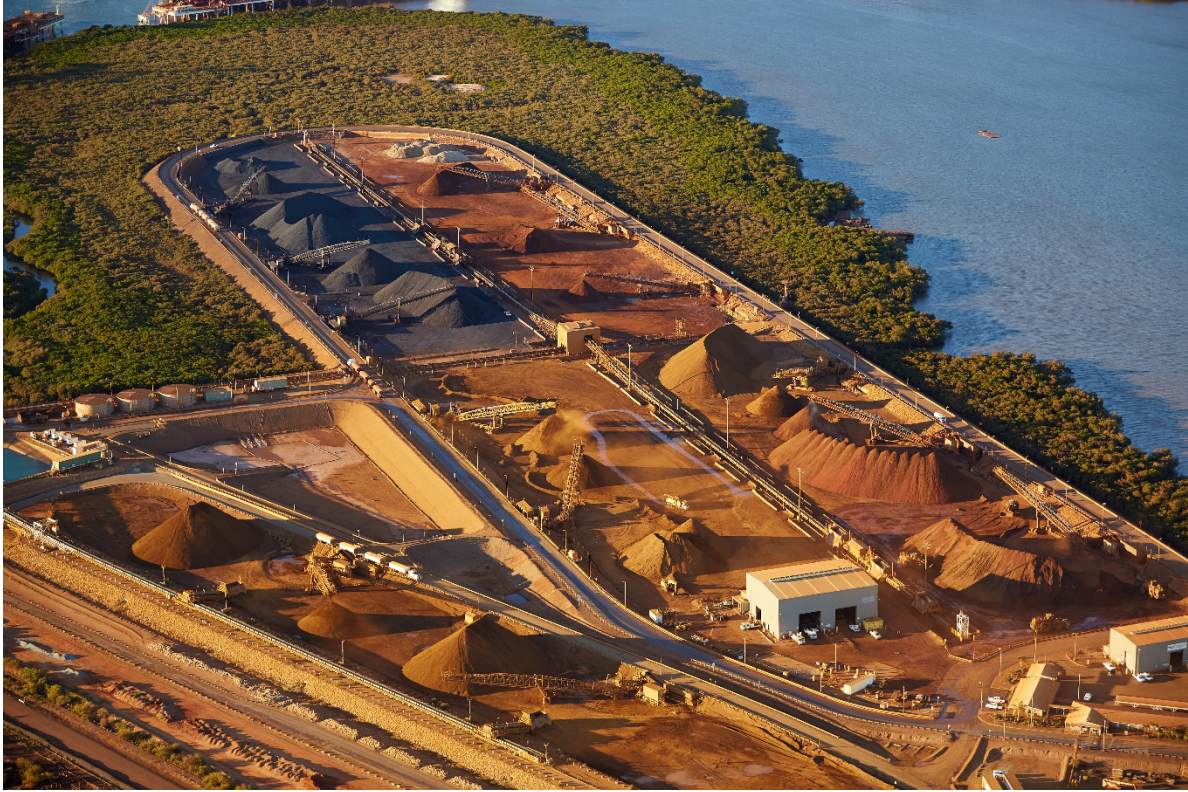
Figure 3: Utah Point, Multi User Berth at the Port of Port Hedland