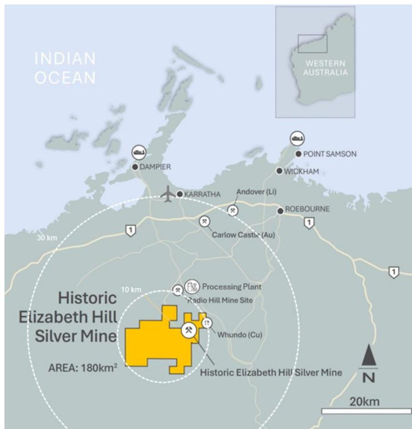
Figure 3: Tenement Location.

Through the consolidation of surrounding land packages into a single contiguous 180km 2 package, significant exploration and growth potential has been created near mine and regionally. The land package holds a significant portion of the Munni Munni fault system, and other fault systems subparallel to the Munni Munni fault system, which are considered prospective for Elizabeth Hill silver deposit analogues.