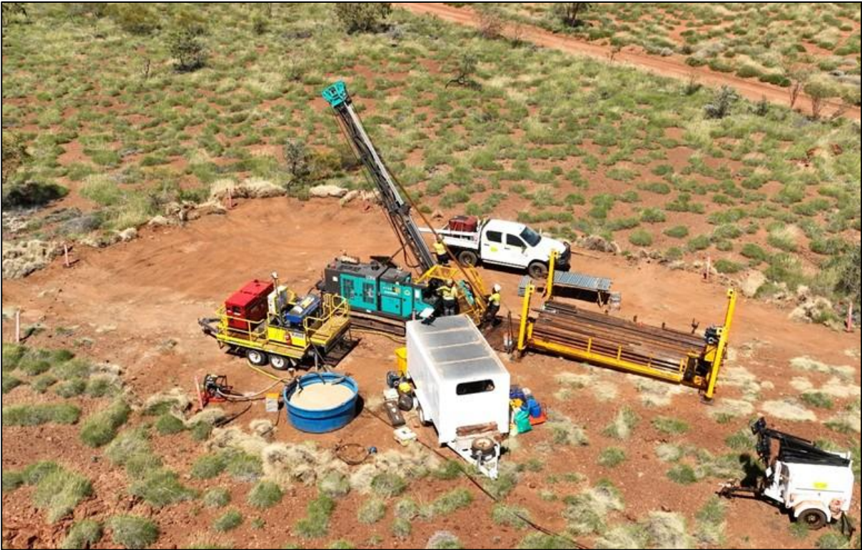
Photo 1: Diamond drill rig currently at Elizabeth Hill. Drilling in progress