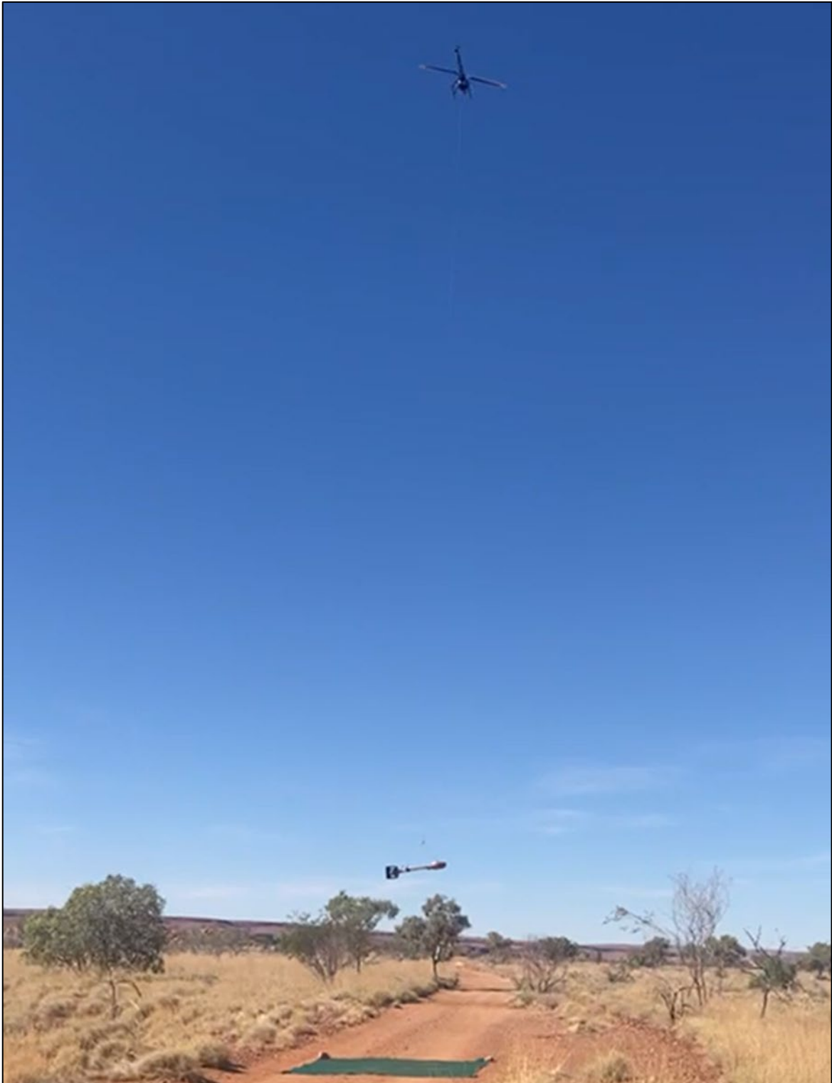
Figure 1: Drone magnetic survey undertaken in October 2025