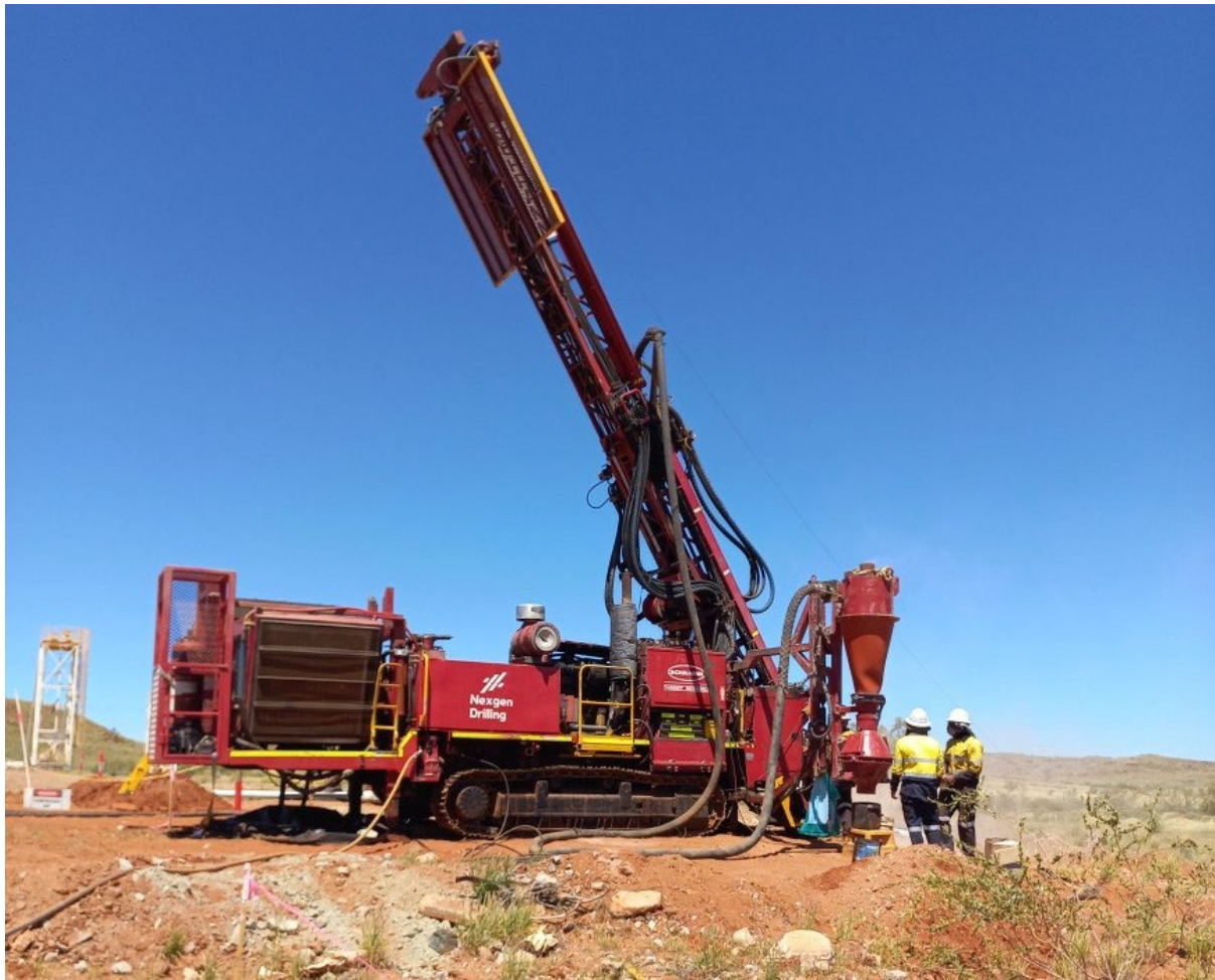
Photo 1: NexGen Drilling 'Schramm T450GT' RC drill rig on first hole of 2026 EHN program.

Note: RC drilling is a form of percussion drilling that uses high pressure air to flush rock chips up the centre of the drill rod for collection at surface in carefully controlled intervals representative of the depth of drilling. As drill chips travel up the centre of the RC drill rod, there is minimum sample contamination. Samples are split, logged and bagged for transport to Perth for laboratory assay.