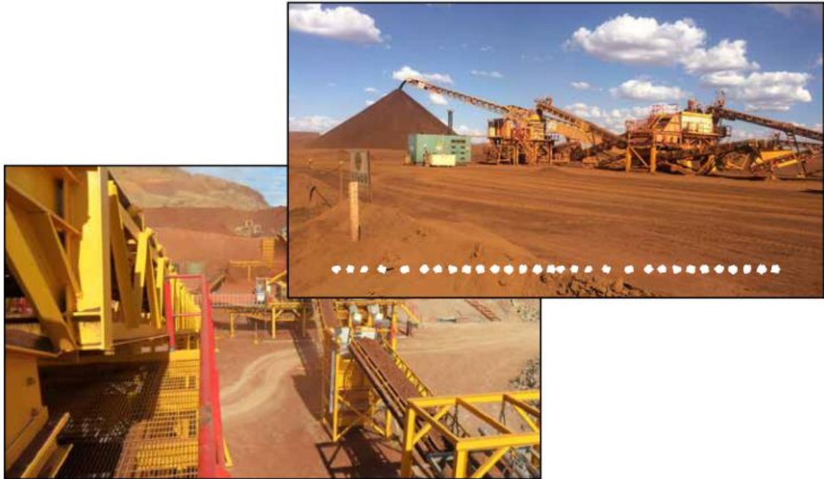
Figure 2: Proposed Crushing & Screening Plant

For further information please visit the Company's website at www.alienmetals.uk , or contact: